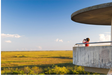
Shark Valley Observation Deck

All projects listed here are priorities on the Florida Forever list and are eligible for Water and Land Conservation Amendment funds.