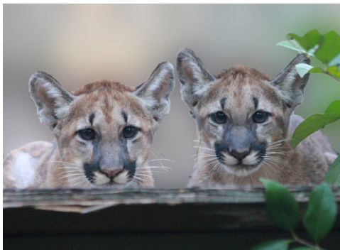
Florida Panther Kittens