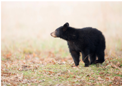
Florida Black Bear